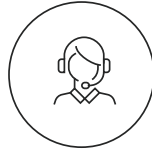
OUTSOURCED CUSTOMER CARE